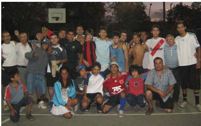
Group photo of several of the soccer tournament participants