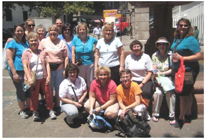
Our precious retreat "Gringas", on an outing