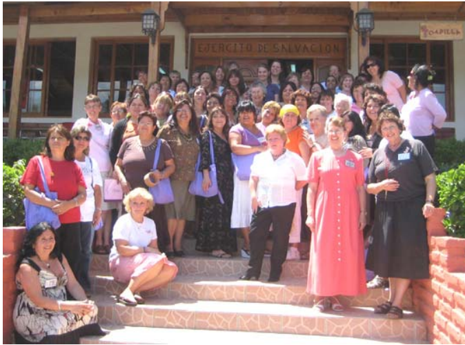
Group photo of most of those attending